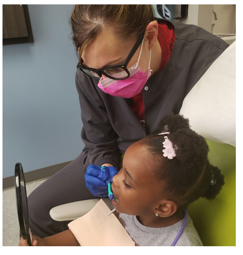
Community Health Center has three mobile units that provide dental services to children in 21 schools across Mid-Missouri. Through these

Community Health Center of Central Missouri is ready to help anyone in need. With a full range of services, we are here to provide quality healthcare to all. We strive to achieve our vision of embracing people, inspiring health.