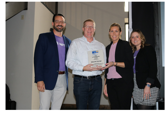
Hitachi Energy received the LIVE UNITED Corporate Award, Community Campaign Division, for its exemplary support of the United Way and the community.