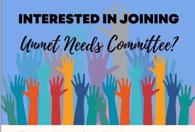
The Unmet Needs Committee is a communitywide committee of health and human service organizations that meets monthly to share resources, network and provide case conferencing as needed.