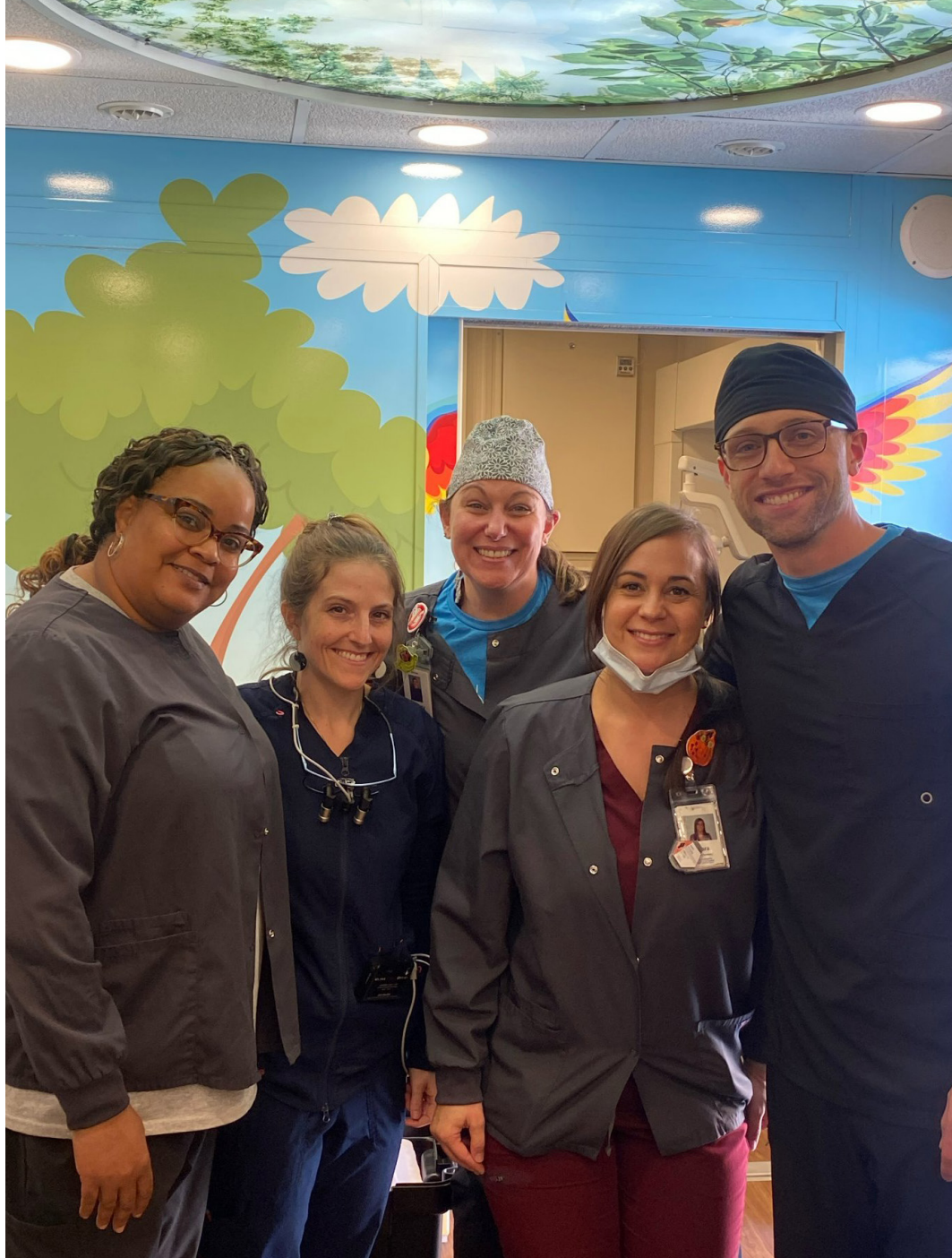
By partnering with the United Way, Community Health Center is able to provide funding assistance to patients who have trouble affording their dental care or the cost of their prescriptions. This helps decrease financial barriers patients have to health care.